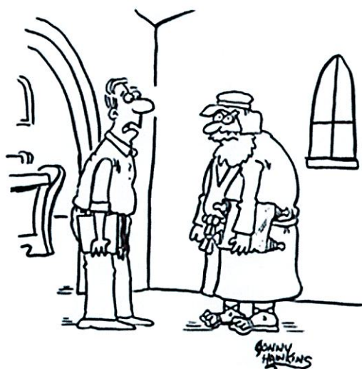
"We'd love to have you speak, Ezekiel, but we're a non-prophet."